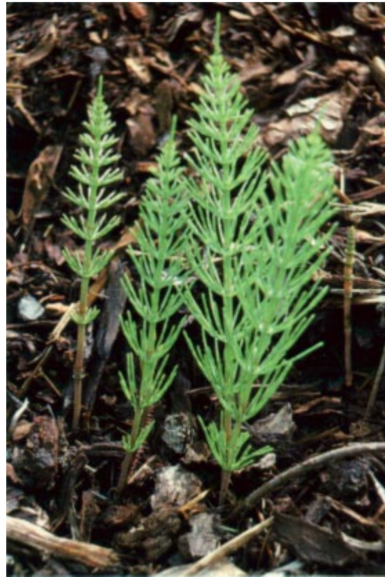
Figure 1.—Field horsetail.

Several species of horsetail and scouring rush are found in the Pacific Northwest. They are perennial, non-flowering plants that reproduce by spores. The spore-producing portion (cone) of the plant contains thousands of dust-like spores equipped with spring-like appendages that uncoil as the spores dry,